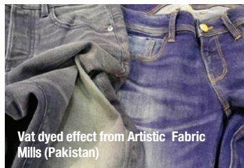
Vat dyed effect from Artistic Fabric Mills (Pakistan)

Artistic Fabric Mills has been able to reproduce the color in a fabric that is commercially viable. The color starts out as a purple-blue and washes down to a grayed blue.