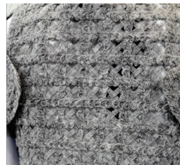
Crochet effects made with tape yarn from Lai's Knitters (Hong Kong)