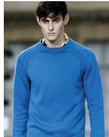
Solid bright colors. Seen at Berluti SS16 catwalk