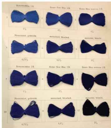
1930's book with actual vintage dye swatches seen at Artistic Fabric Mills