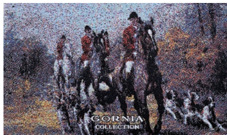
Premium labels from Manifattura Etichette Tessute (Italy)