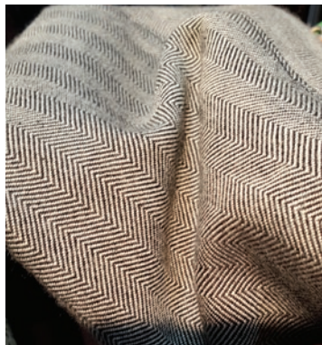
Wool denim from Berto (Italy)