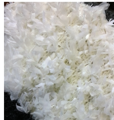
Paper yarn in nylon-mohair-spandex from Best Shan (Taiwan)