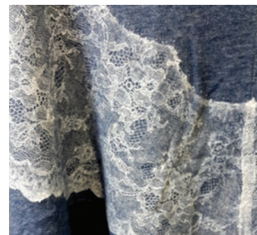
Needle punched lace on knitwear. Seen at Lai's Knitters (Hong Kong)