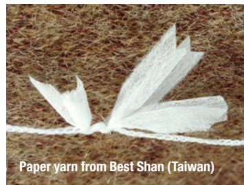
Paper yarn from Best Shan (Taiwan)